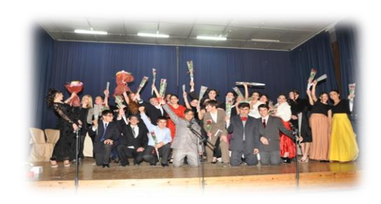
Final scene from the theatrical play "Wedding" Anton Tsechof