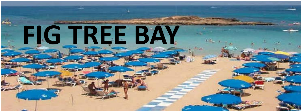
FIG TREE BAY

Fig Tree Bay is the most popular beach in Protaras. Its name is derived from a fig tree that stands alone close to the beach. Golden sands and a buzzing day life and an even more frantic night life is the name of the game due to the many restaurants, bars, discos and cafes close by.